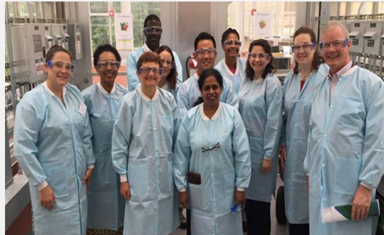
Biosciences Industry Fellows Program