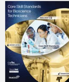
Skill Standards Publication