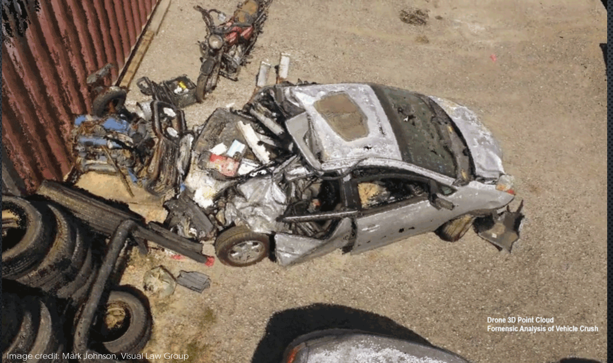
Drone 3D Point Cloud Forensic Analysis of Vehicle Crush