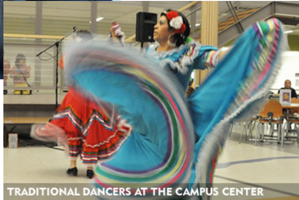
TRADITIONAL DANCERS AT THE CAMPUS CENTER